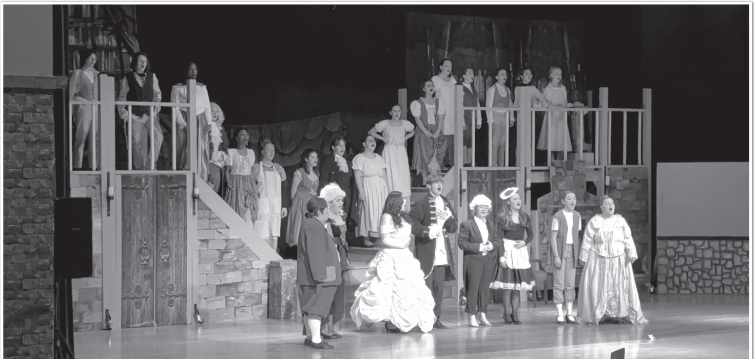
↑ Drama Club students presented their production of Beauty and the Beast to the community the weekend of March 22.