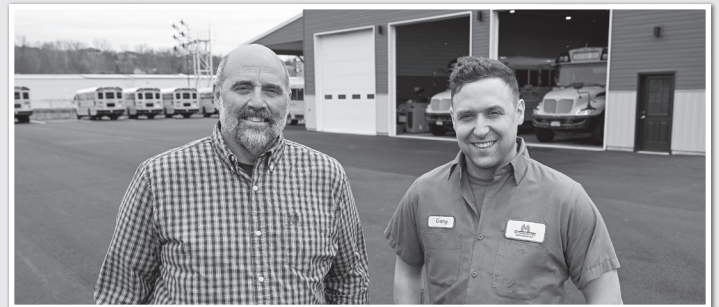
↑ MCSD's new bus garage is located at 10 Industrial Park Drive.