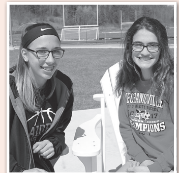
↑ Students take a break in the Adirondack chairs overlooking the recently renovated track, part of Phase I of the capital project.