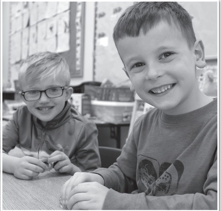
↑ Students in Mrs. Connelly's kindergarten class using crystals to make math sentences.